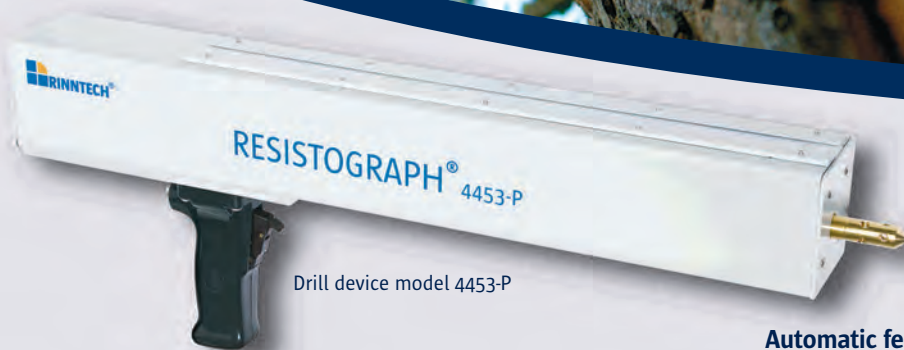
Drill device model 4453-P