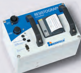
PowerPack (contains battery pack, printer and data memory)